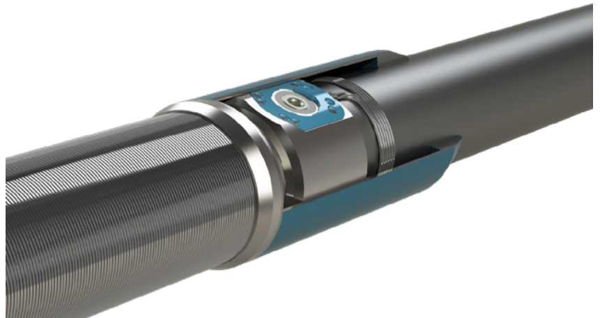
The AICV ® is the most advanced and proven reversible autonomous technology that can shut-off unwanted gas and water inflow and increase oil production and oil recovery

The most advanced generation, InflowControl's patented Autonomous Inflow Control Valve (AICV ® ) is the first and only commercially available technology that can completely shut-off unwanted fluids autonomously and locally in the well making fields 'economical' once again. The AICV ® balances the inflow of oil along the well and autonomously chokes or shuts-off the gas and/or water breakthrough zones while still allowing oil production from the rest of the reservoir thereby tackling the issues associated with high GOR / WC and optimising production.